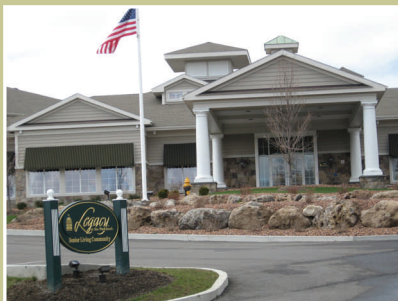
Chili Civic Beautification Winner