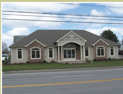
Gates Civic Beautification Winner